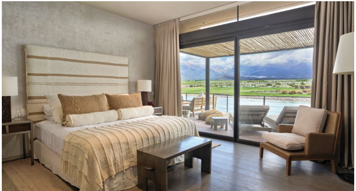
Bedrooms include design details that aim to highlight Andean culture, such as blankets, cushions and rugs woven from llama hair and made by local artisans.