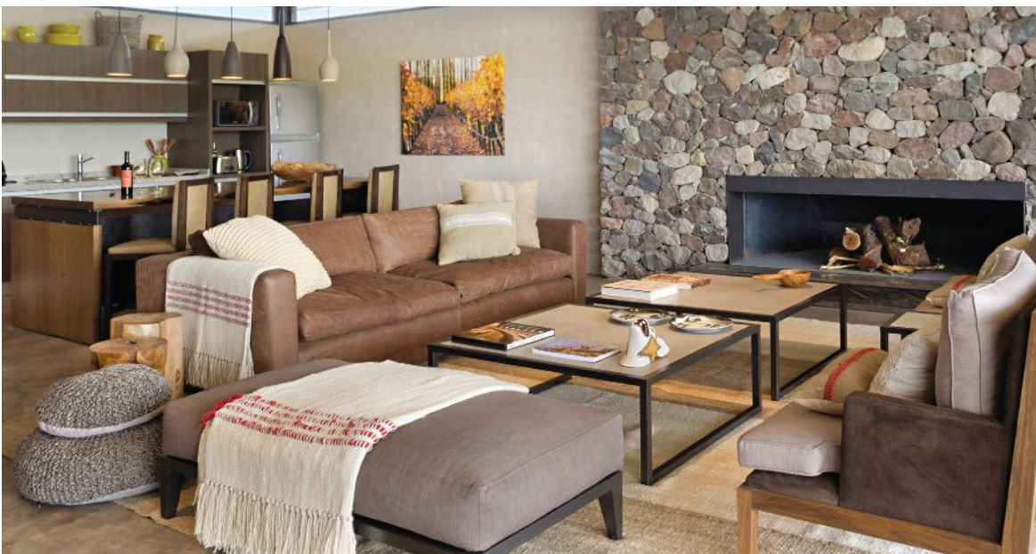
Villas offer three distinct floor plans, with some featuring a fireplace and eating area.