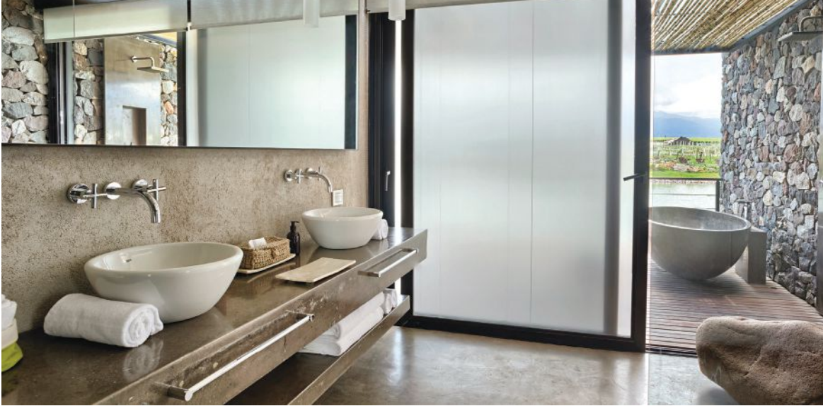
Bathrooms are appointed with wood and stone, inspired by the natural palette of the Uco Valley.